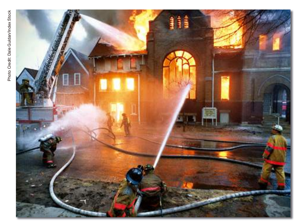
Property Damage Fires are the number one cause of property damage to homes. How does property insurance protect homeowners?

Standard Fire Policy Property owners can buy individual insurance policies to protect themselves against specific types of threats. Fires pose the greatest threat to property. They account for a large share of all property damage in the United States. Many people buy a standard fire policy to insure against damage due to fire or lightning. A policyholder can add other types of protection to this basic policy with extended coverage .